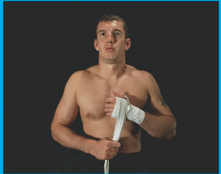
Left: Shimon Attie, Joachimstrasse 11a, Berlin , Ektacolor photograph, 20 x 24 inches, 1993. Right: Shimon Attie, The Boxer , Lambda Print, 33 1/2 x 40 inches, 2007.

Born in Los Angeles in 1957, Shimon Attie lived in Europe for seven years before moving to New York in the fall of 1997. He has exhibited widely in both the United States and Europe, including shows at the Institute of Contemporary Art, London; the Centre Georges Pompidou, Paris; and the Museum of Modern Art, New York. His work is held in the permanent collections of the Museum of Modern Art, New York; the Berlinische Galerie, Berlin; and the Jewish Museum, New York.