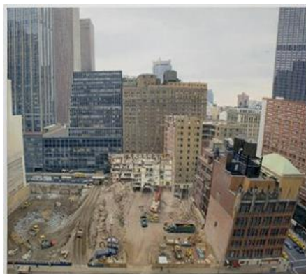
Image: Demolition and Excavation on the Site of the Equitable Life Assurance Society's New Tower at 7th Avenue and 52nd Street. 1983.Oil on canvas.