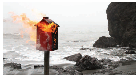
Image: Video still from Firebox