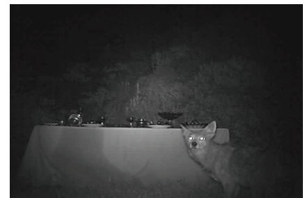
Image: Video still, Don't Feed the Animals