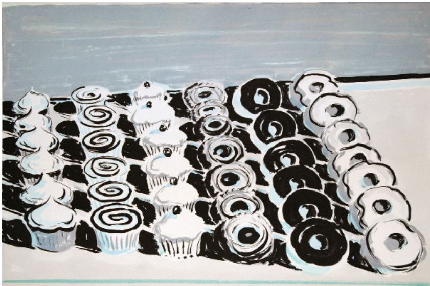
Wayne Thiebaud. Cupcakes and Doughnuts. 2007/2008, hand-worked aquatint with watercolor.

EVENT CO-SPONSORED BY THE ART HISTORY AND DESIGN DEPARTMENTS THE CREATIVE WRITING PROGRAM AND THE DAVIS HUMANITIES INSTITUTE