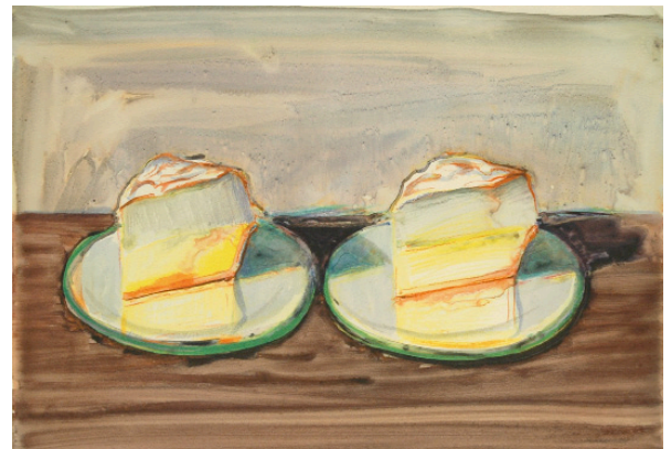
Wayne Thiebaud. Two Meringues. not dated, hand-worked lithograph with watercolor and ink