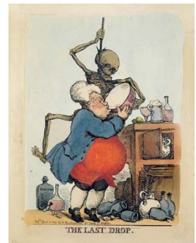
Image: Thomas Rowlandson, The Last Drop , 1811, etching with watercolor on paper

Early satirical prints are important social documents that comically portray people and situations of interest to their contemporaries. The exaggerations created were not simply recordings of these people and events but were knowingly critical or infused with popular prejudices revealing the absurdities and hypocrisy of the subjects. Most often the prints were also titled so there was no possible doubt of their intended meaning. Because they sold singularly and cheaply, in large numbers, like comic books today, many have survived over the centuries. – from www.ilab.org